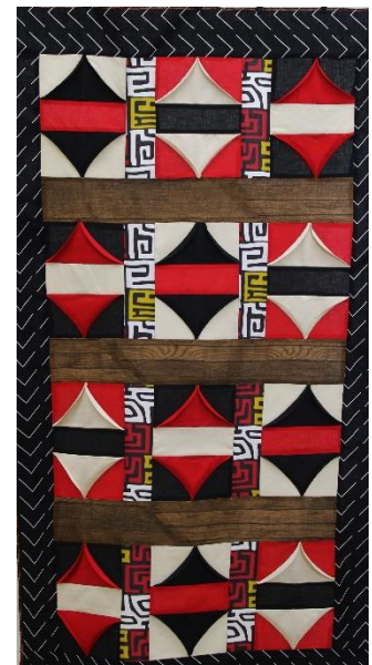
“Ida’s Journey” Textile Exhibit Piece