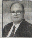
JOHN PACK BOWLES

Warren Webb buried 5-2-11 2nd add. West half Lot 21 grave 4