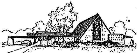
CAPITOL MORTUARY'S CHAPEL OF THE ANGELS 7177 West Colfax, Denver, Colorado